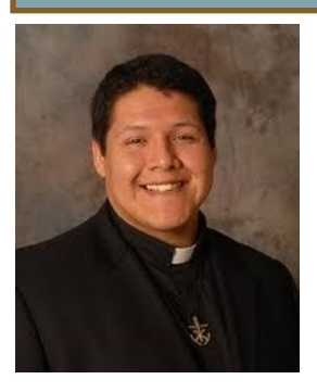
Dear Holy Redeemer,

Palm Sunday presents us with two extremes. The crowds that call to Jesus, "Hosanna," ("Save us, we pray") will cry loudly for his death in barely five days' time. On this great holy day of preparation, this day that begins our Holy Week in the Church, we recall both of these moments: Christ's triumphant entry into Jerusalem, and Christ's Passion and Death on the Cross.