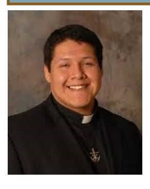
Dear Holy Redeemer,